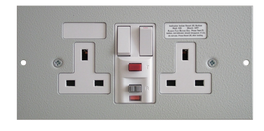
STO291/RCD (TYPE A) <sup>[4]</sup> Twin Switched RCD Protected Sockets