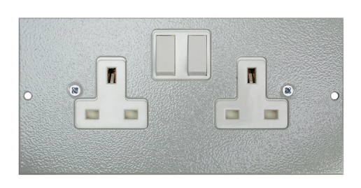
STO291/SW <sup>[2]</sup> Twin Switched Sockets (side wired)