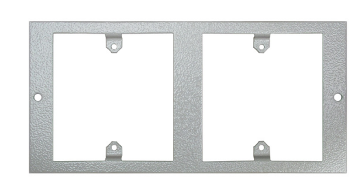
STO286 <sup>[1]</sup> 2 x Single Accessory Plate (Accepts Standard Accessory Plates)