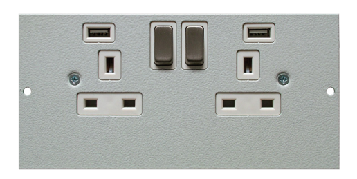
STO291/USB <sup>[4]</sup> Twin Switched Sockets with USB charging ports