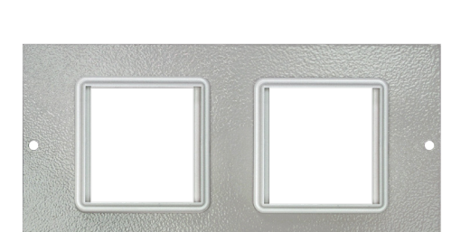
STO294 <sup>[3]</sup> 2 x 50mm Euro Module Plate