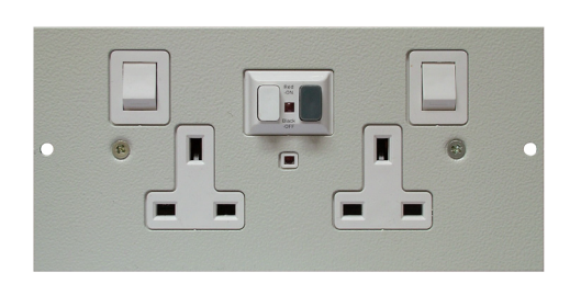
STO291/RCD (TYPE B) [4] Twin Switched RCD Protected Sockets