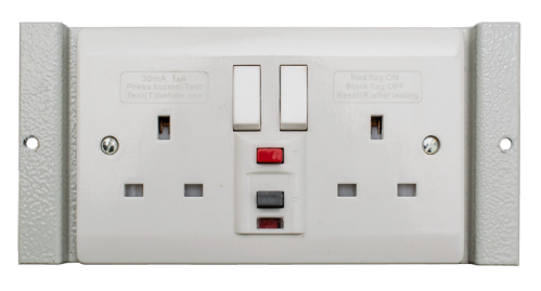
STO291/RCD/FM <sup>[4]</sup> Moulded Plastic Twin switched RCD Protected Sockets