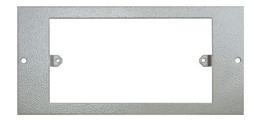
STO287 <sup>[1]</sup> Standard Twin Accessory Plate (Accepts Standard Accessory Plates)