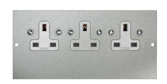
STO295 Triple Unswitched Sockets