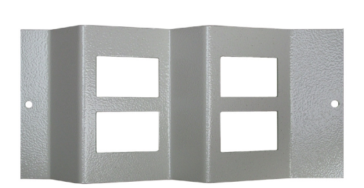
STO284/W 4 Way Wave Data Plate 4 x 37x22mm LJ6C Module Cutouts